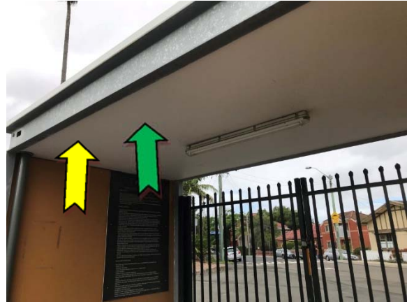
Photo 2. Exterior, throughout, ceiling – non asbestos-containing fibre cement sheeting and suspected lead-containing white upper paint system.