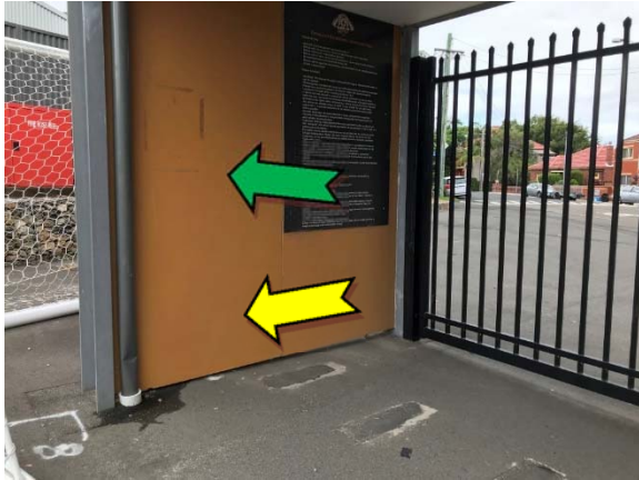
Photo 1. Exterior, throughout, walls – non asbestos-containing fibre cement sheeting and suspected lead-containing orange upper paint systems.